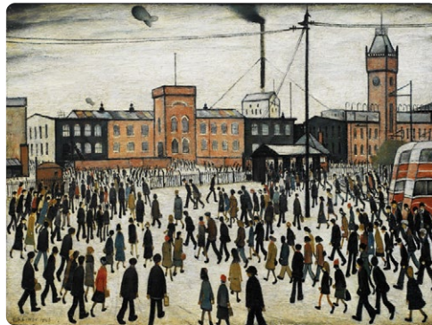
'Going to Work', 1943